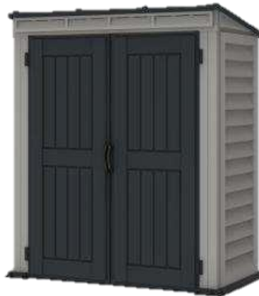
5 ft. 6 in. x 3 ft.