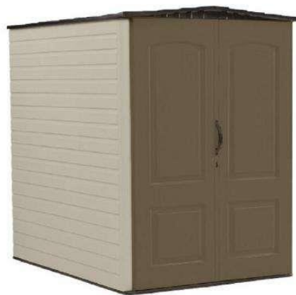
6 ft. 3 in. x 4 ft. 8 in. Resin Storage Shed