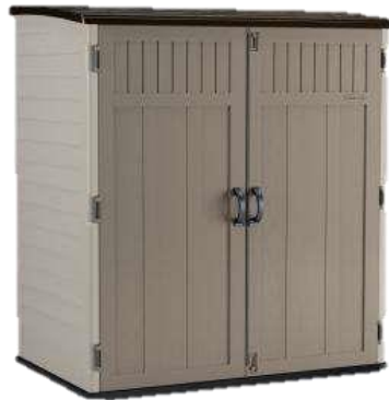
5 ft. 10.5 in. x 3 ft. 8.25 in. x 6 ft. 5.5 in. XL Vertical Storage Shed