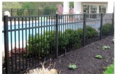
Straight Topped Wrought Iron or Aluminum Fence