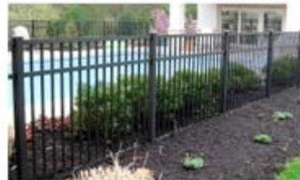
Straight Topped Wrought Iron or Aluminum Fence