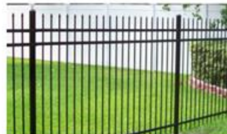
Ornamental Spear Top Wrought Iron or Aluminum