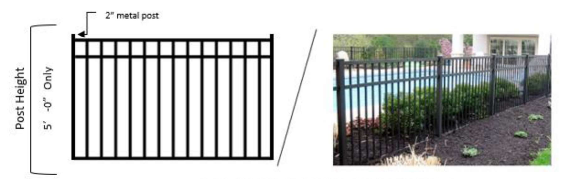
Straight Topped Wrought Iron or Aluminum Fence