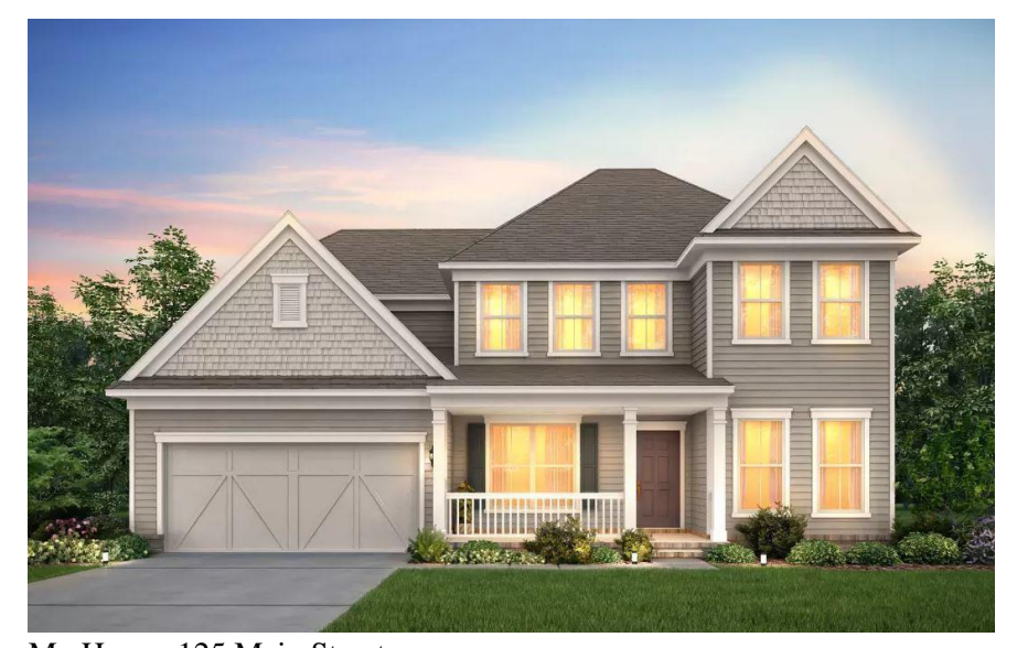
My Home: 125 Main Street