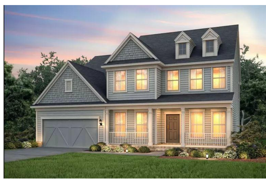
Neighbor on right: 127 Main Street