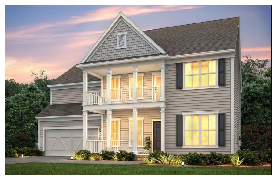
Neighbor on left: 123 Main Street