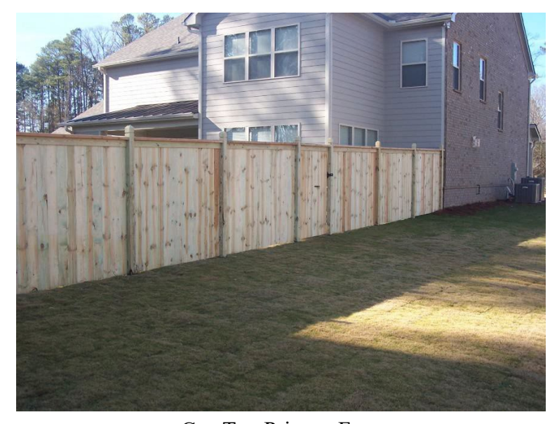
Cap Top Privacy Fence