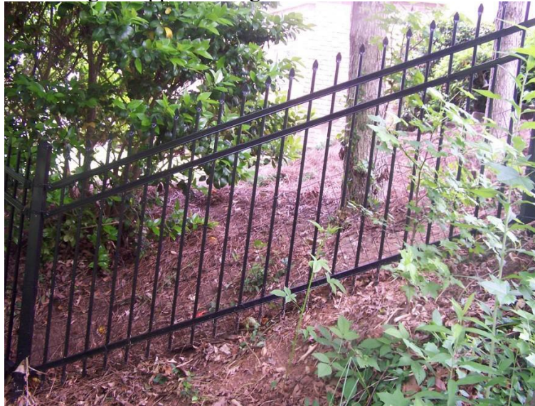
Speartopped Wrought iron or aluminum fences