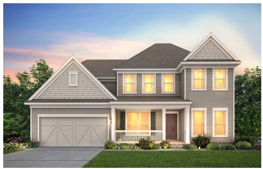
My Home: 125 Main Street