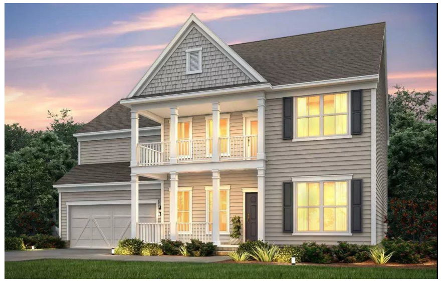
Neighbor on left: 123 Main Street