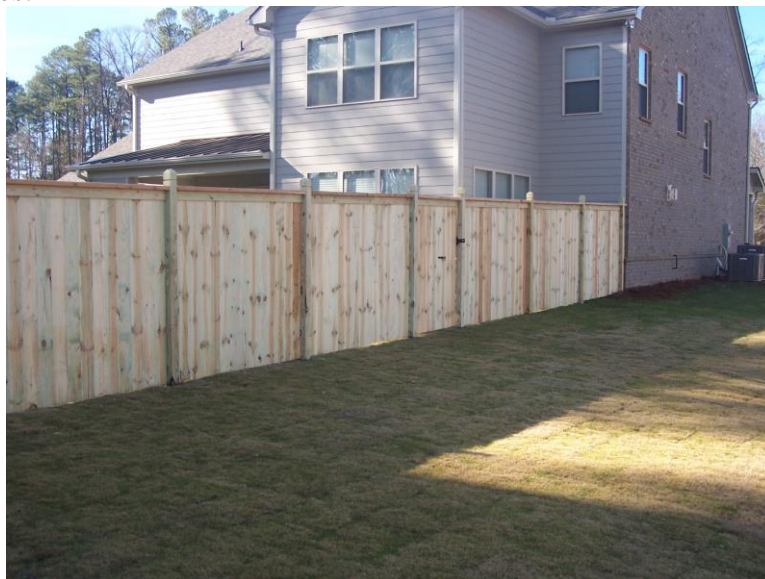
Cap Top Privacy Fence