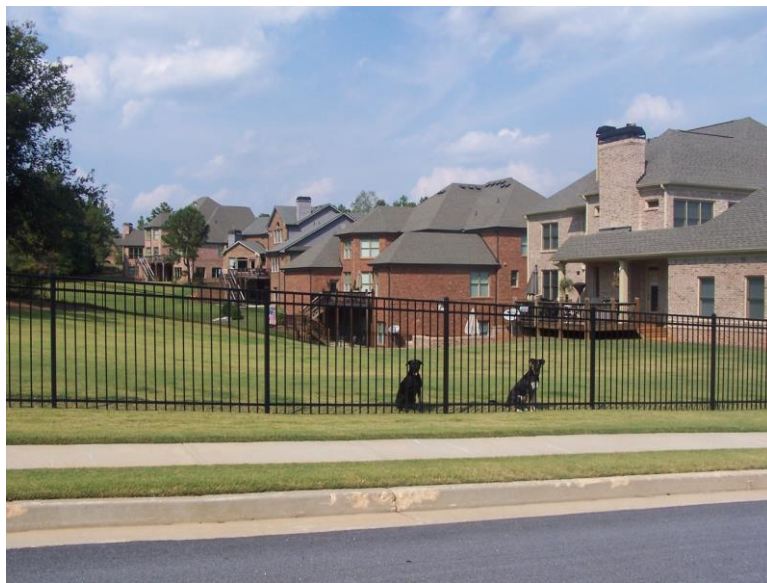
Straight Topped Wrought iron or Aluminum Fence