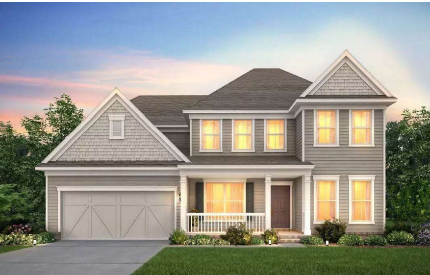
My Home: 125 Main Street