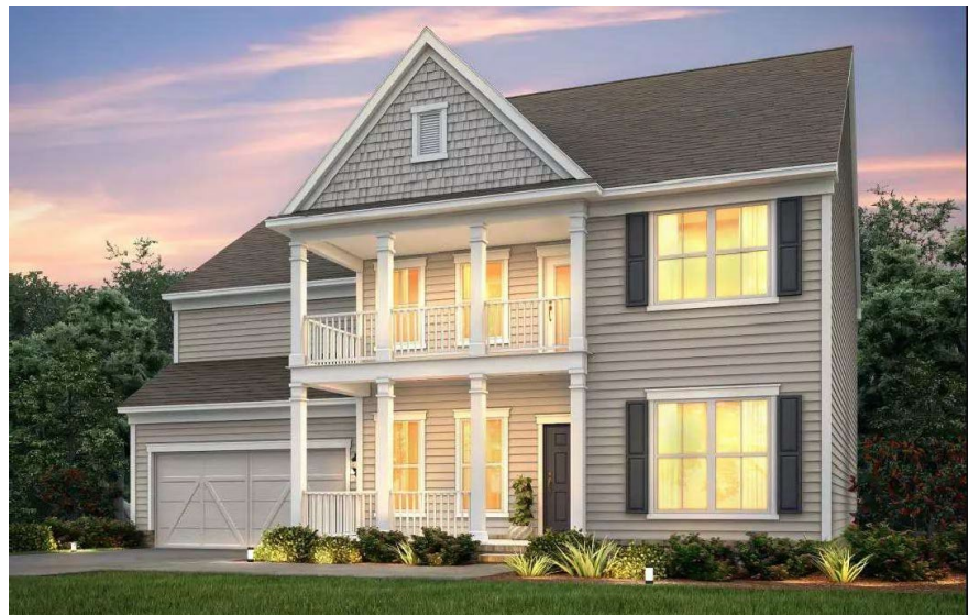
Neighbor on left: 123 Main Street