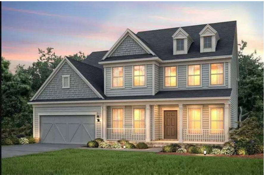
Neighbor on right: 127 Main Street