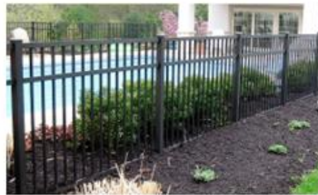
Straight Topped Wrought Iron or Aluminum Fence