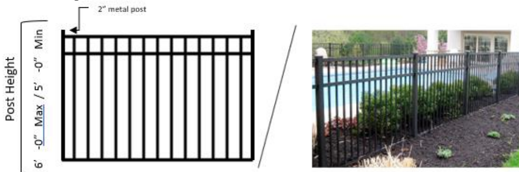
Straight Topped Wrought Iron or Aluminum Fence