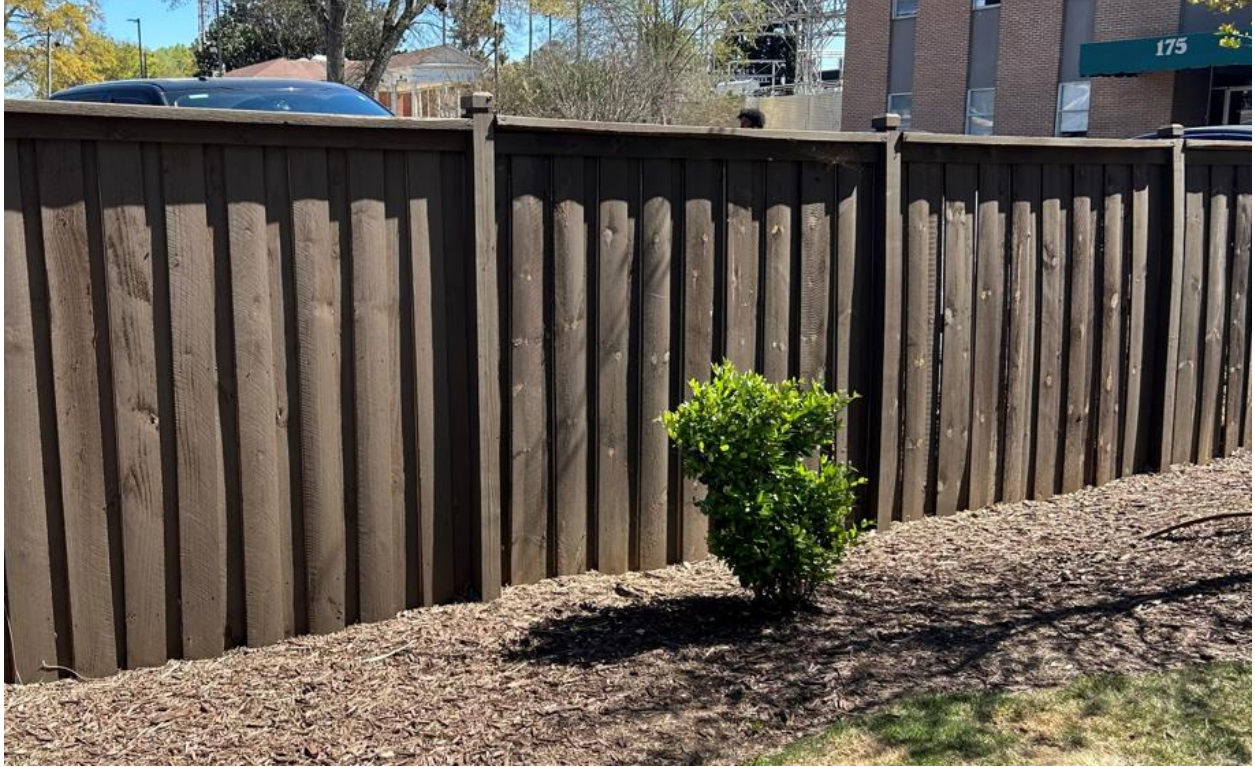
6' Wooden Board on Board, Cap Top